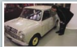
The Heritage Motor Centre is home to a fascinating collection of exhibits. For details, visit the website at: www.heritage-motor-centre.co.uk