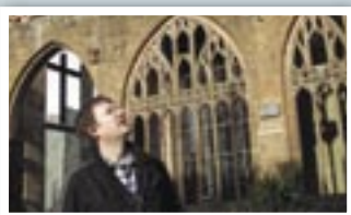
While in Coventry, I took time to look around the ruins of the Cathedral, famously bombed during WW2. Close by is the shopping centre.

Seems like I've moaned a lot this month, but there's also a lot to like about this Adria. If you're after a van conversion with a permanent bed, plus a large rear storage area and the ability to carry a couple of passengers in the back, plus a reasonable toilet compartment, then the Adria Twin SF could be the perfect choice. It has few rivals and it looks good, too.