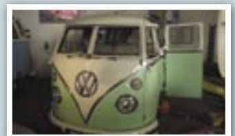
The Coventry Transport Museum is right in the centre of the city and it's free to enter. Check out the website: www.transport-museum.com