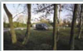
The Caravan Club's Chapel Lane site was my home. It's very close to the NEC - ideal if you're visiting a show there and want to stay nearby.

As it was December, I decided to use my time with the Adria to visit motor museums in the Midlands, where the exhibits, and visitors, are kept nice and warm inside! Although some smaller museums shut for winter, the three I visited are open all year, so are great for a short winter break. If your partner isn't into motoring, there's plenty to do in the area, with lots of shops to explore. My home was the Caravan Club's Chapel Lane site, on the outskirts of Birmingham. For details of all the exhibits, the museums I visited have good websites, so be sure to check these out.